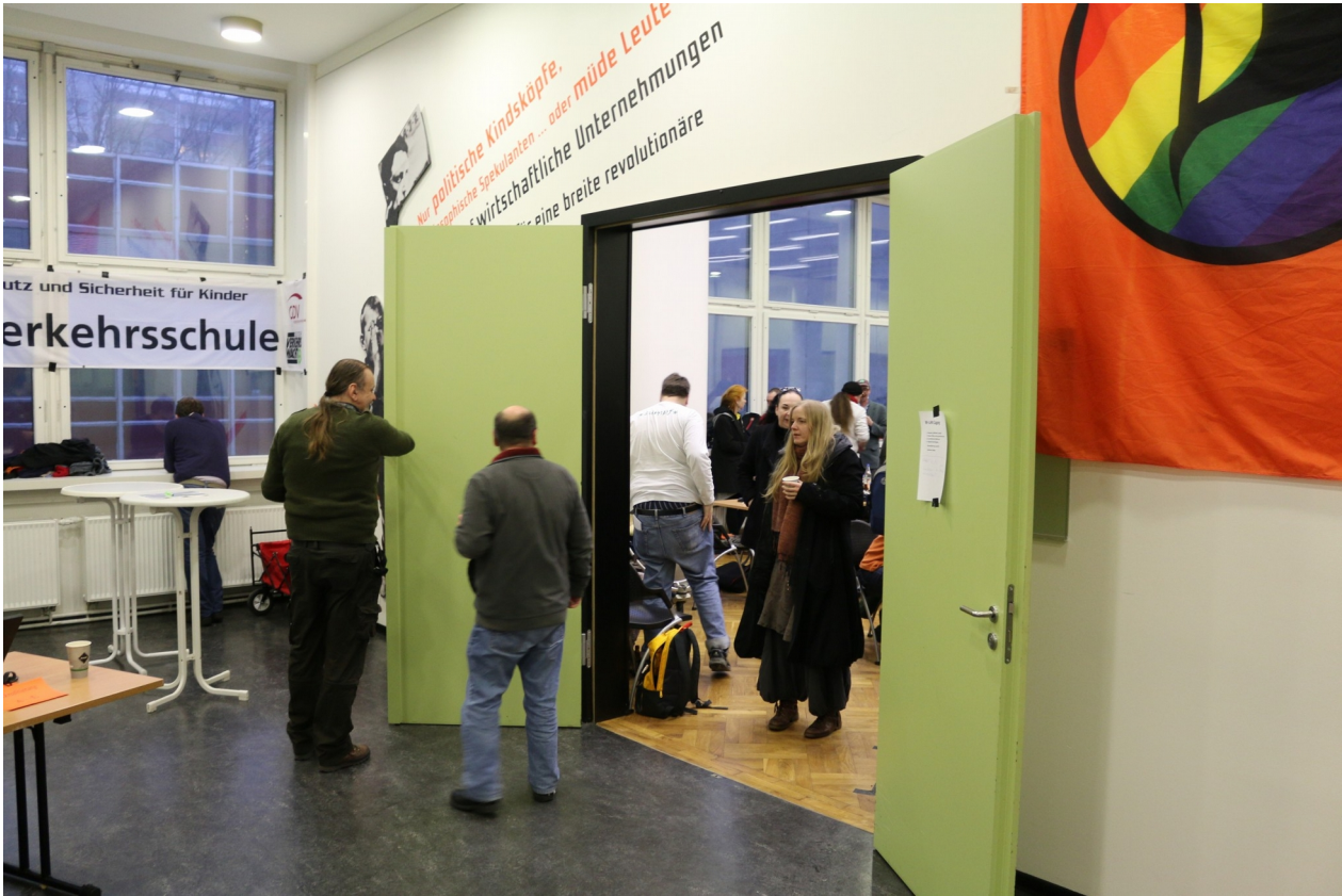
Main door to the Münzenbergsaal (Foyer) and doors at the side of the main hall (Umgang)